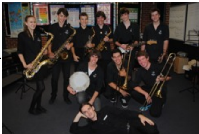
Swing Band at Bicton PS

These include: Kardinya PS (14 March) Bicton PS (22 Mar) Coogee PS (26 Mar)